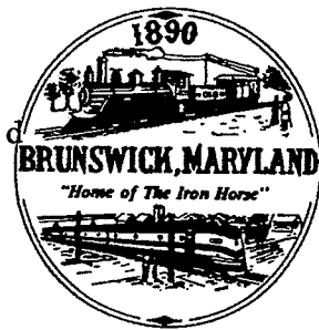
Exhibit "A" - to 09.30.08 Disclosure. CITY OF BRUNSWICK

1 W. Potomac Street • Brunswick, Maryland 21716 • (301) 834-7500