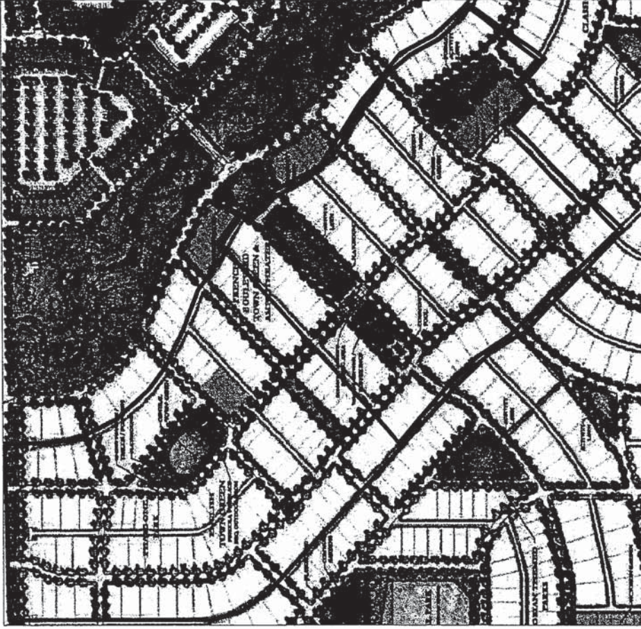
Exhibit C Diagram of the Improvement Project Improvement Areas 1 & 2